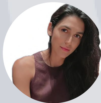
Russani Creative manager

Informative property catalogues and personal presentations are used by brokers and partners in their work with clients. They allow the client to quickly navigate among the properties on the property market.